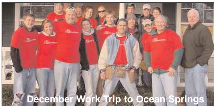
December Work Trip to Ocean Springs