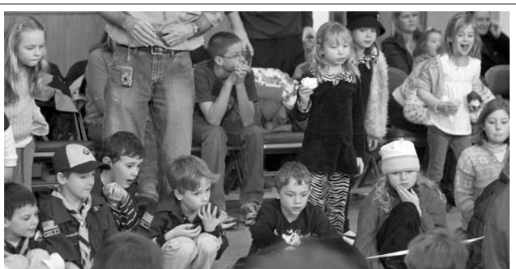
PINEWOOD DERBY IN FELLOWSHIP HALL ON JANUARY 24, 2009