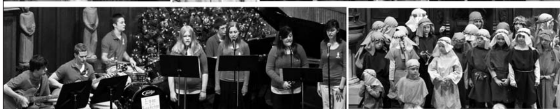
THANKS TO EVERYONE WHO HELPED AND PARTICIPATED IN THIS YEARS PAGEANT!